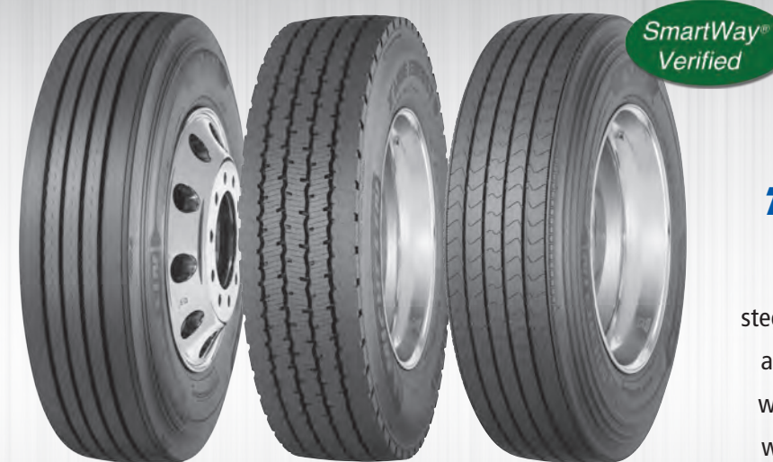
MICHELIN® X® Line™ Energy Z MICHELIN® X® Line™ Energy D MICHELIN® X® Line™ Energy T